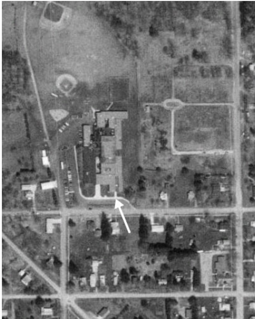
Aerial View of East Forest School

1993 Marienville West NE, PA Aerial Photograph . USGS Reference Number 41079-D2-02-PHT. Created on April 27, 1993.